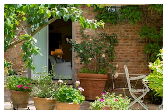
Please check this profile on our website for more pictures. Thank you.