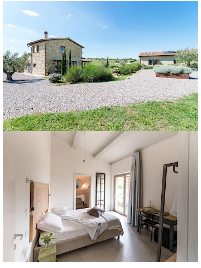
Please check this profile on our website for more pictures. Thank you.