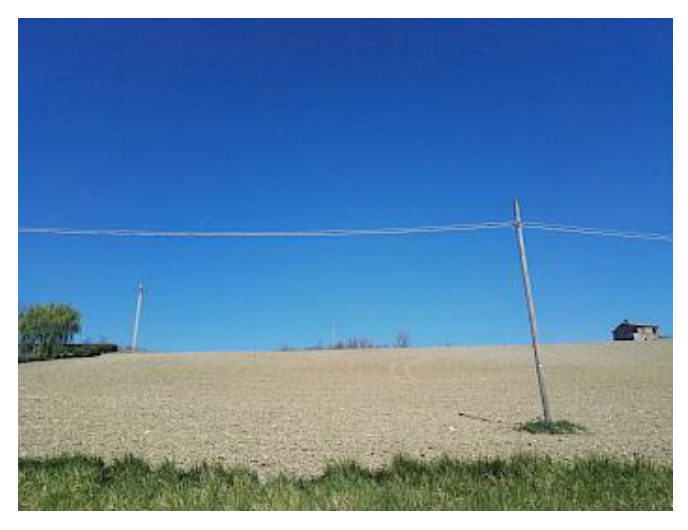
Please check this profile on our website for more pictures. Thank you.